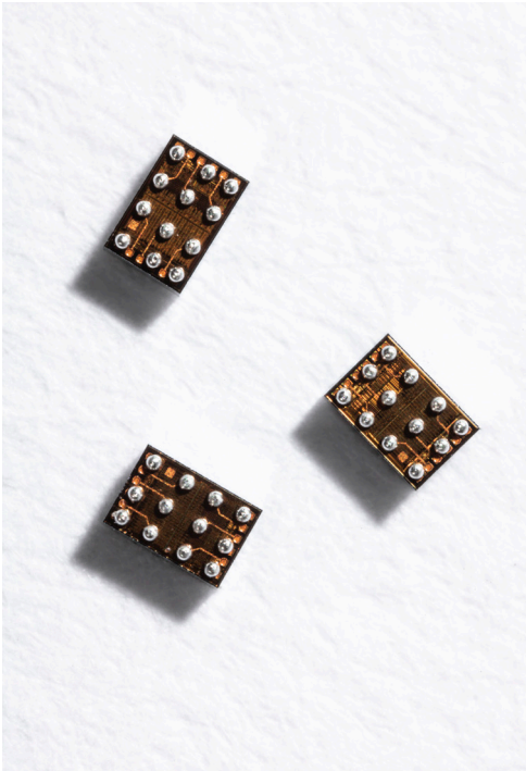
The Human Body Detector by Microdul (HBD)

Microdul's Human Body Detector (HBD MS8891) detects when a product is worn. When not in use, it can automatically switch off power-intensive functions, thereby significantly extending battery life and runtime.